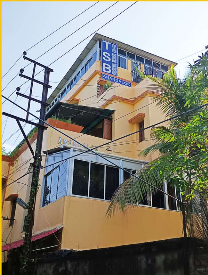
Photograph of the College Building THAKUR SUKHDEV BRAHMACHARI BIOCHEMIC MEDICAL COLLEGE & HOSPITAL, GARIA, KOLKATA - 700152, WB