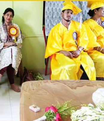
(From top left clockwise): Students in College Classroom, appearing in DMBS & BMBS Examinations, Convocation Ceremony in TSBB Medical College.